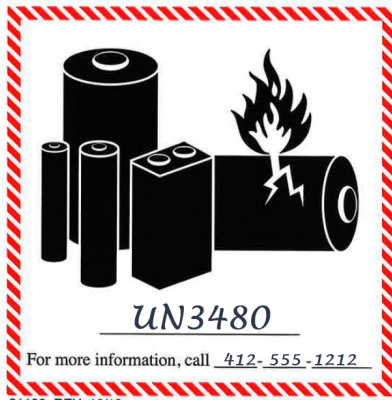
Battery handling mark