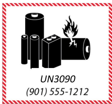
Battery Handling Mark